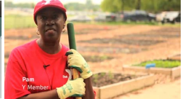
Shows the results of the project.