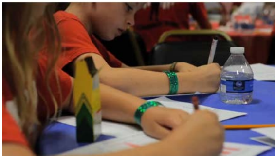
Have “B roll” for illustrating the point quote is making.