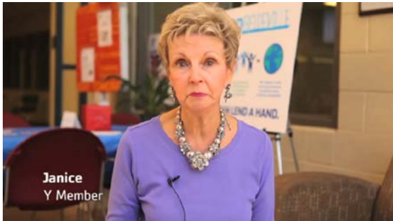
Quote number 3 gives detail of the experience of giving through the Togetherhood program.