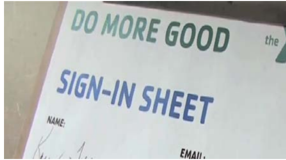
Have "B roll" for illustrating the point the quote is making.