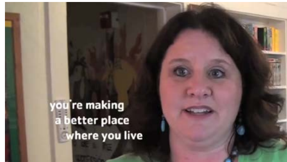
Closing shot – show the relationships that were built.