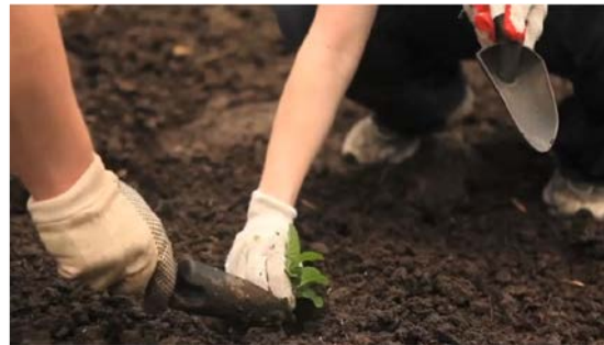
Opening shot – Establishes location and people involved.