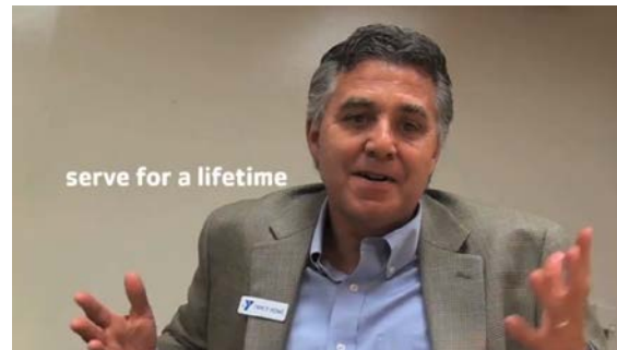
Quote number 2 gives detail of the impact of the project and why it is important.